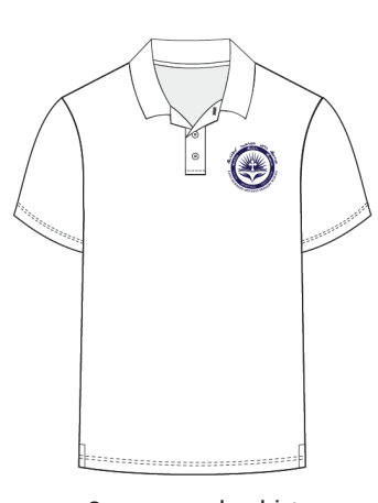
Summer polo shirt